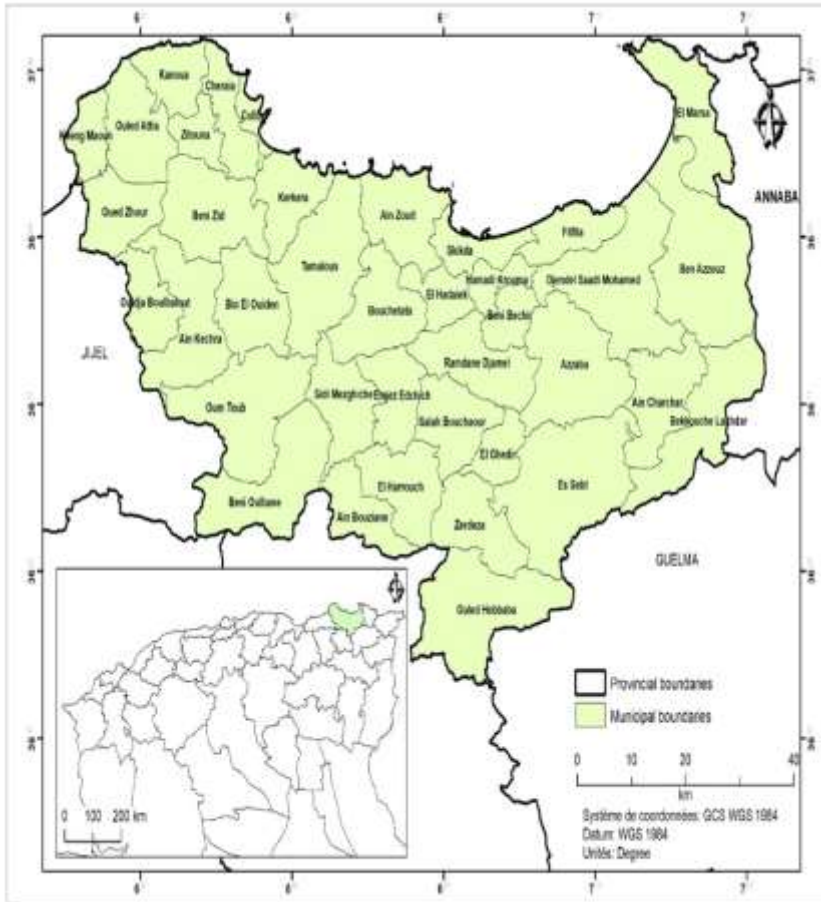
Figure 1. Location of the Skikda Province